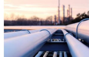
GAS DISTRIBUTION ADVISORY

390 Bay Street, Suite 1702 Toronto, Ontario M5H 2Y2 Tel: (416) 643-6610 Fax: (416) 643-6611