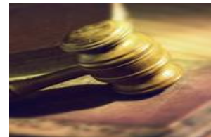
EXPERT TESTIMONY & LITIGATION CONSULTING