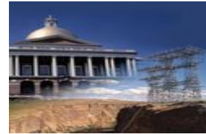
REGULATORY ECONOMICS, PBR & MARKET DESIGN