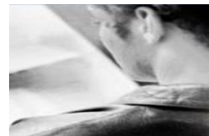
ASSET VALUATION, PRICE FORECASTING & MARKET ANALYSIS